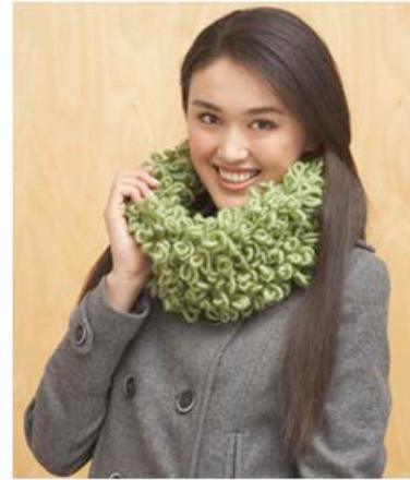
Bernat Roving - Loopy Cowl knit