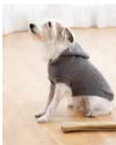
Hoodie Dog Coat (knit)