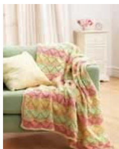
Lacy Waves Afghan (knit)