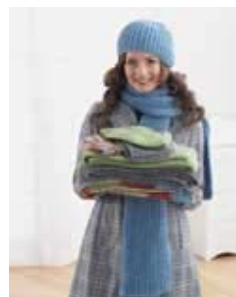
Shaker Rib Hat and Scarf (knit)