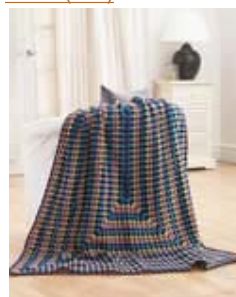
Granny Blanket (crochet)

We're so glad to share these great Bernat® yarns and patterns with you yesterday, today and tomorrow.