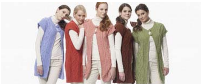
Long Cabled Vest (knit)

If you're looking for more inspirational patterns to use with the exciting new shades of Bernat® Super Value, look no further. From garments to accessories to afghans, the possibilities never stop. Download these great patterns today and spend some quality time with your needles and hooks.