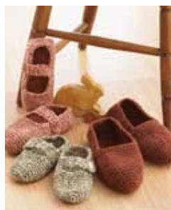
Family Slippers (crochet)