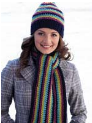
Scarf and Hat (knit)