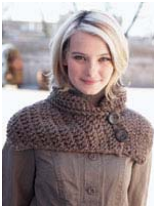
Buttomed Wrap Scarf (knit)

With never-ending to-do lists, we understand that projects that are fast and easy are a must in the holiday season. These free patterns are quick, easy, and fun. Most importantly, they're portable! Get your crafting done while in line at the bank, waiting for the bus, at kids' sporting events, or wherever you find yourself with a few spare minutes. Start checking people off that list by casting on today.