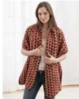
Striped Shawl (crochet)