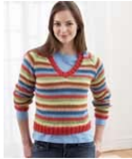
Sweater with Stripes (knit)