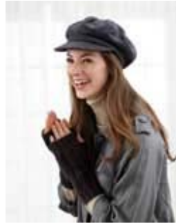
Fingerless Gloves (knit)