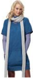
Dress with Kangaroo Pockets and Super Long Scarf (knit)