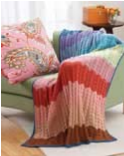
Feather and Fan Afghan (knit)