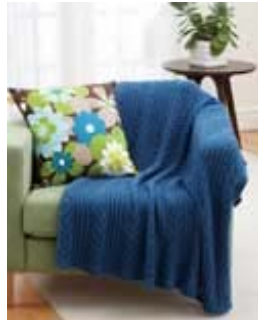
Lacy Throw (knit)